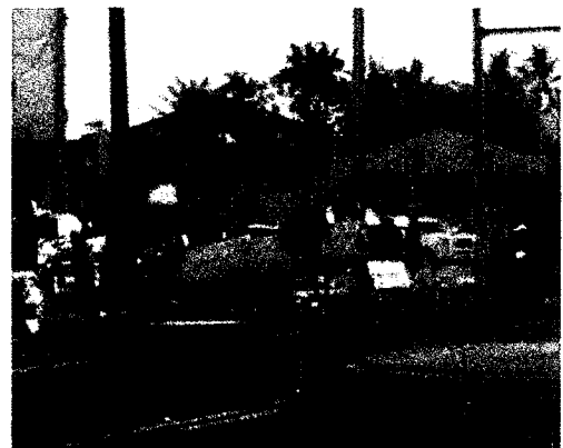
Traffic was rerouted and backed up for miles at the height of the morning rush hour along Marine Corps Drive in Hagåtña after a white pickup truck flipped in front of the Hagåtña Boat Basin yesterday morning.

The southbound lane was closed because of the mess from